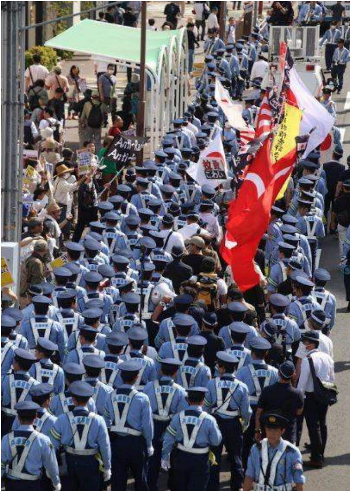
(The picture shows a row of hundreds of police officers who surround and protect about 30 participants of hate demonstration who holds "recapture the abduction victims" in Kobe City, Hyogo Prefecture on June 3, 2018.)

Even today, organizing hate demonstration and making hate speech against unspecified groups are legal and the practice of the police protecting a small number of hate demonstrators by a large number of officers almost every time, restricting counter-protests and protecting discriminatory demonstrations continues.